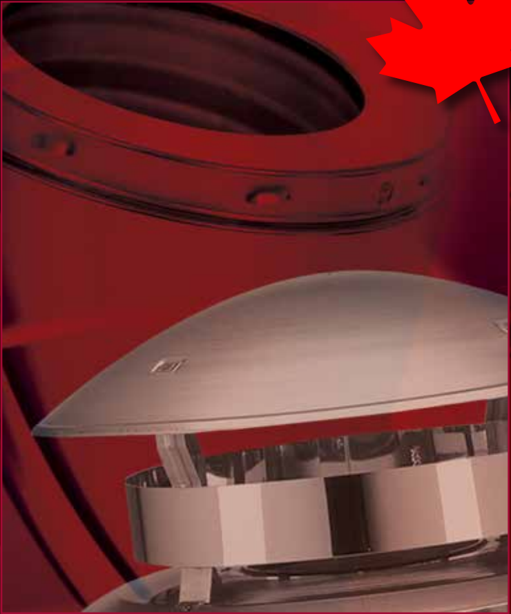
A High-Temperature, 1" Double-Wall All-Fuel Chimney For Canada