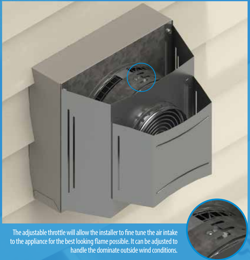
The adjustable throttle will allow the installer to fine tune the air intake to the appliance for the best looking flame possible. It can be adjusted to handle the dominate outside wind conditions.

By incorporating interchangeable and customizable shrouds, customers can tailor the look of the termination. Shrouds will be available in a variety of materials and/or designs. The heart of the termination is a patent pending combustion air control. This control reduces the need for internal appliance baffling, and allows for improved combustion performance across a variety of gas burning direct vent appliances. The external footprint has been minimized to achieve an 11" x 11" for both 4 x 6 and 5 x 8 sizes.