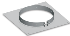
Firestop Radiation Shield Connector Support 6DTC-FRSCS / 7DTC-FRSCS / 8DTC-FRSCS