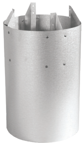
Radiation Shield Connector 6DTC-RSCI / 7DTC-RSCI / 8DTC-RSCI