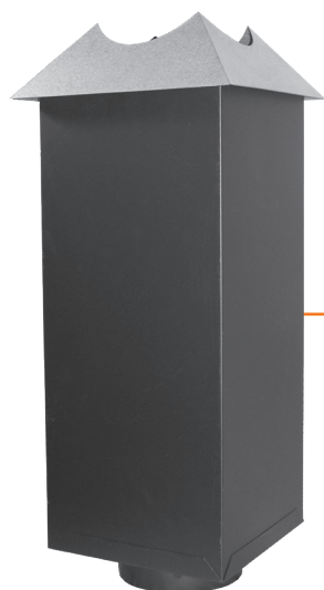
DTP-RCS shown with standard Square-to-Round Collar

That's what you get with the DTP Reduced Clearance Ceiling Support for use with DuraTech Premium insulated chimney.