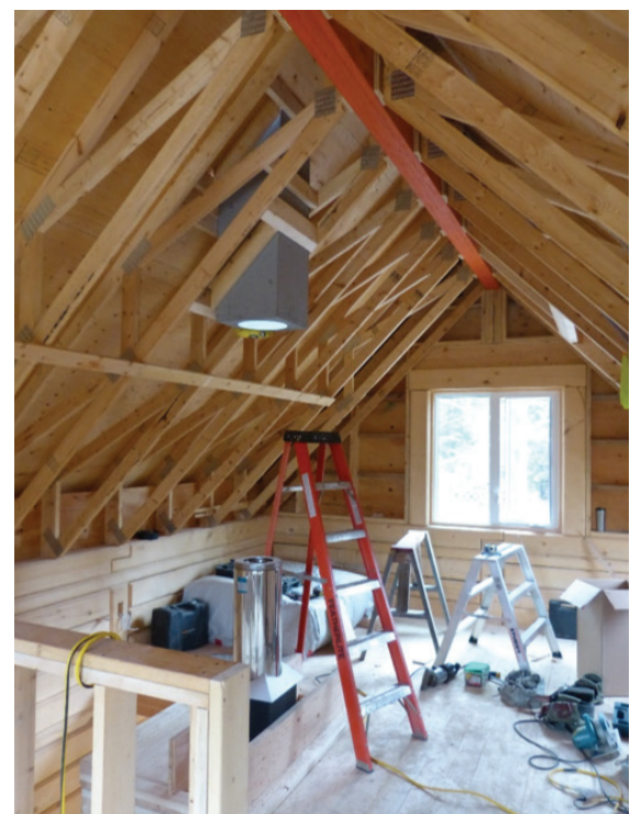
View from the upper floor with vaulted ceiling. The Pass-Through Radiation Shield is already in position.