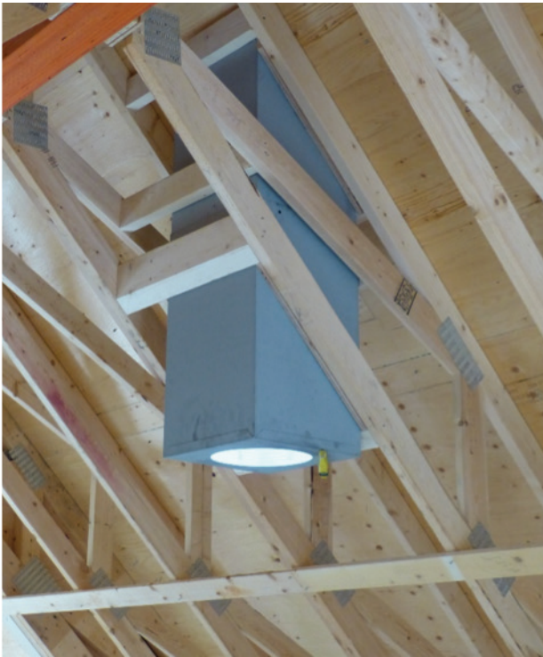
Pass-Through Radiation Shield in place within truss assembly