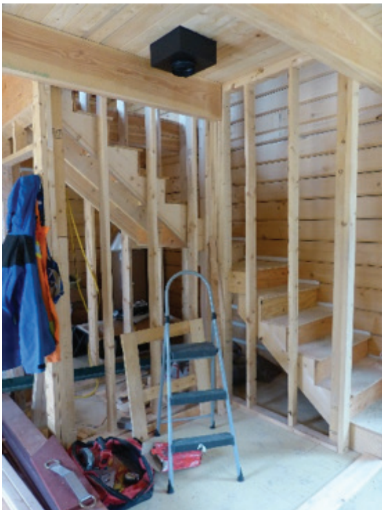
Reduced Clearance Support was used at the ceiling on the main floor.

In this project, a free-standing woodstove is located on the main floor. It passes from the Reduced Clearance Support and continues through the upper floor which has a vaulted ceiling.