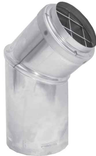
Round Style Cap

Complete up-to-date clearance to combustible information, installation instructions, and warnings are enclosed, or available at www.duravent.com .